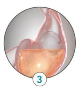
Microcatheter is removed, leaving the inflated balloon behind.