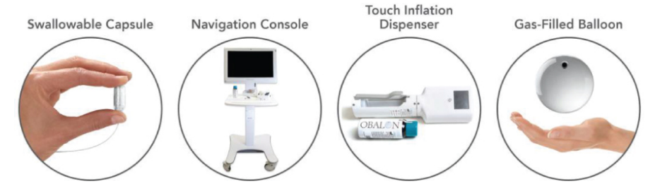
Capsule, balloon and microcatheter technology

The main components of Obalon's current generation Obalon Balloon System consists of a swallowable capsule that contains an inflatable balloon attached to a microcatheter; the Obalon Navigation System console, which is a combination of hardware and software used to dynamically track and display the location of the balloon during placement; the Obalon Touch Inflation Dispenser, which is a semi-automated, hand-held inflation device used to inflate the balloon once it is placed; and a disposable canister filled with our proprietary mixture of gas.