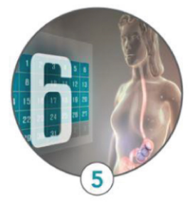
After six-month treatment period, all balloons are removed in a short, endoscopic procedure.